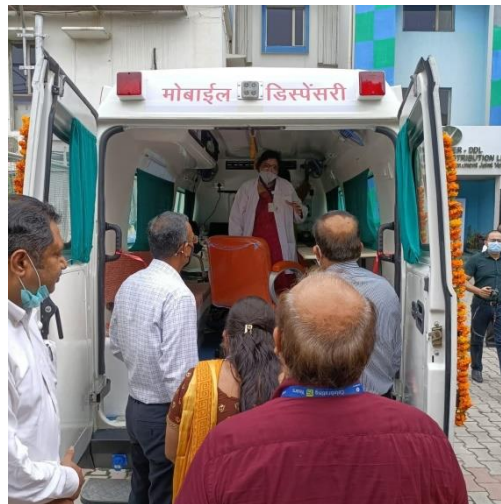
July 2021- Inauguration of Mobile van -5th