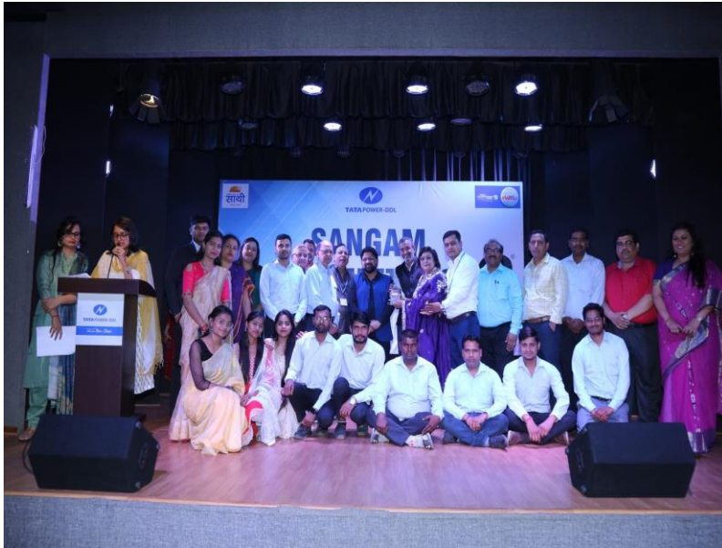
Felicitation – 2023 for best performance