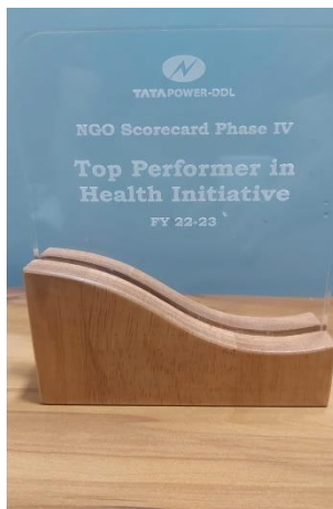
Top performer in Health Initiative- 2023