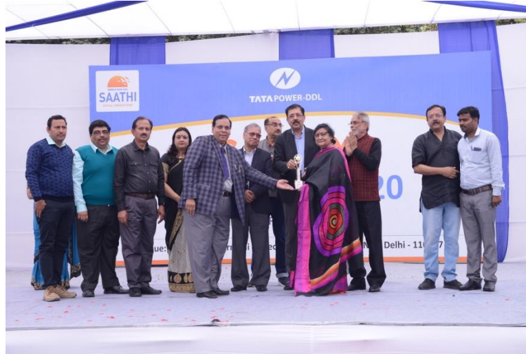
Award for Arogya project-2020