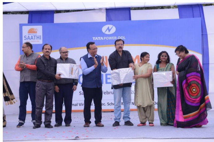
Top performer in Health Initiative-2020