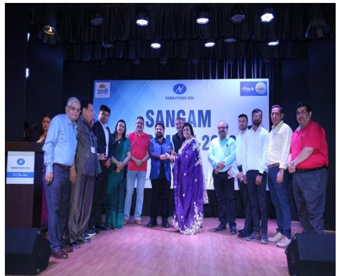
NGO Participants- Women Empowerment-2023